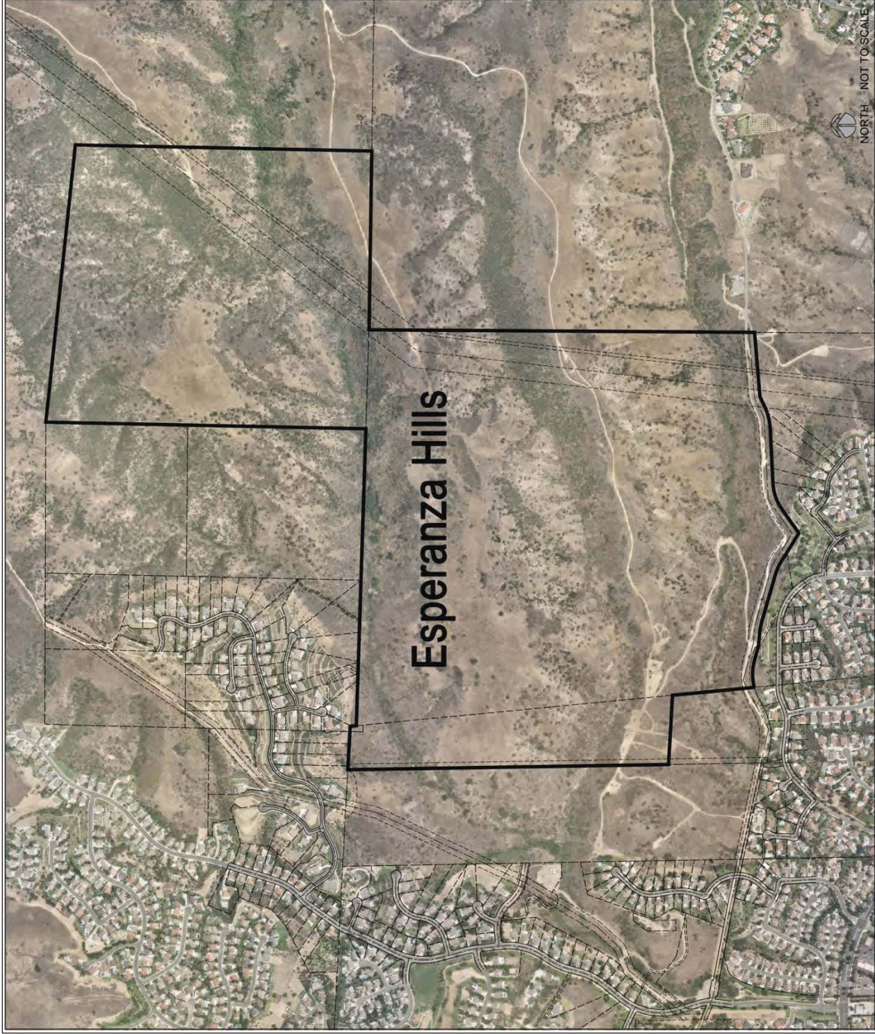
Exhibit 4 – Aerial View